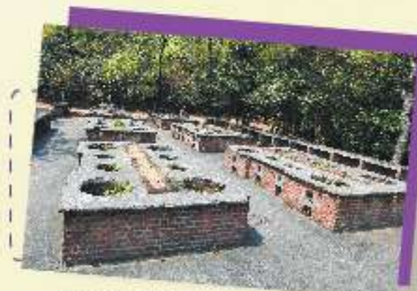
野外爐灶遺址 Outdoor stoves

The two outdoor stoves in the Tai Tam (Quarry Bay extension) Country Park were built during 1938 to 1939 for cooking food in the time of war. In addition to the stoves, there are some other relics nearby such as food depots and caves which might have been used for hiding.