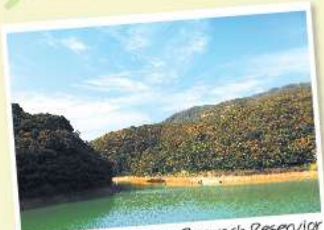
大潭副水塘 Tai Tam Byewash Reservoir

大潭郊野公園位於港島東部，約為香港島面積的六分之一，是港島區最大的郊野公園。公園內的大潭谷群山環抱，綠意盎然，幽谷的水庫宛如港島郊野的翡翠；在大潭水塘畔漫步，更可細味大潭水塘匠心獨運的水務歷史建築群。