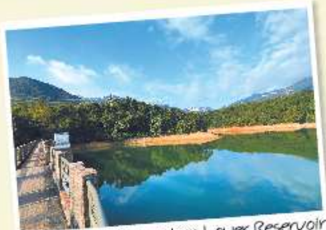
香港仔下水塘 Aberdeen Lower Reservoir

The Aberdeen Country Park covers a wide domain of southern uplands and valleys. The Aberdeen Upper Reservoir and the Aberdeen Lower Reservoir here are the youngest reservoirs built on Hong Kong Island. You cannot help marvelling at the grand reservoirs and dams and the flocks of black kites hovering over the valley.