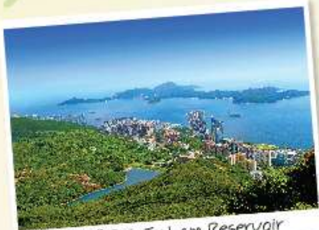
薄扶林水塘 Pok Fu Lam Reservoir

薄扶林郊野公園由環繞薄扶林水塘及扯旗山的土地組成。公園內的薄扶林水塘是港島首個興建的水塘，與四周翠綠林蔭交織出一片壯麗優美的湖光山色。扯旗山是香港著名的旅遊區，林木茂盛，與山下維港綽約風姿相映成一幅令人驚嘆的都會風光。