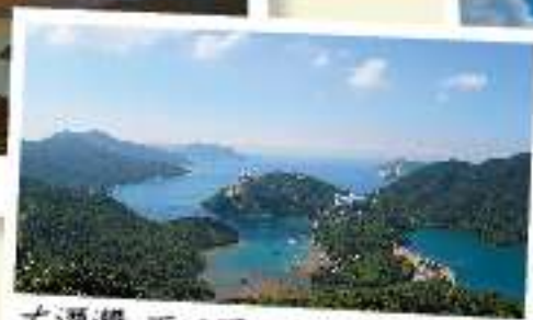
大潭灣 Tai Tam Bay