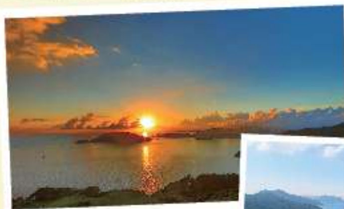
孖崗山 The Twins

Country parks on Hong Kong Island present us the sharp contrast between natural scenery and metropolitan beauty. Looking down from above, you will feast your eyes on the unique landscape interwoven by the green countryside and the bustling city. Amazing scenes in the country parks include towering mountain peaks, pleasant reservoirs and verdant trees. Among others, the Victoria Peak, Dragon's Back and Tai Long Wan are highly acclaimed tourist attractions. Besides, time-honoured reservoir architectures, war ruins and historic sites in the parks will tell you what Hong Kong has experienced over the past century, triggering you to explore more in past memories.