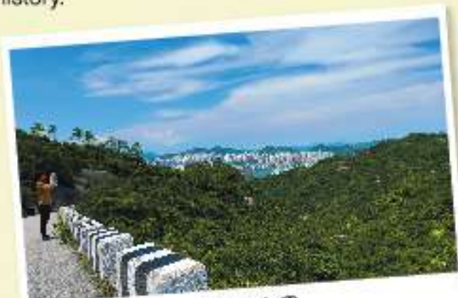
大潭(鰐魚涌擴建部分)郊野公園 Tai Tam (Quarry Bay Extension) Country Park

The country park lies on the northern edge of the Tai Tam Country Park. Standing on the top of Mount Parker, you can overlook the graceful Victoria Harbour. In foggy days of spring, the top of Mount Parker offers the best view of sea of clouds in the city. Historic buildings in the park, including the Woodside Biodiversity Education Centre and wartime communal stoves, tell tourists more about Hong Kong's history.