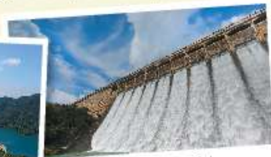
大潭篤 Tai Tam Tuk