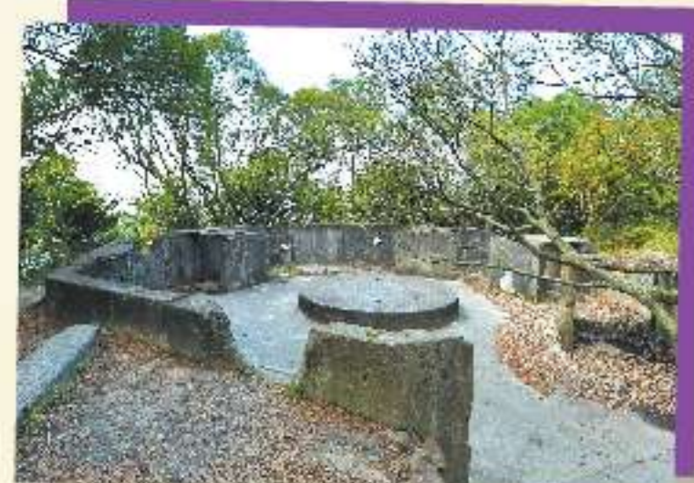
松林炮台 Pinewood Battery

Situated on Lung Fu Shan, the Pinewood Battery is the only existing anti-aircraft battery built before the war in Hong Kong. With war legacies around, it has become a mark of the Battle of Hong Kong.