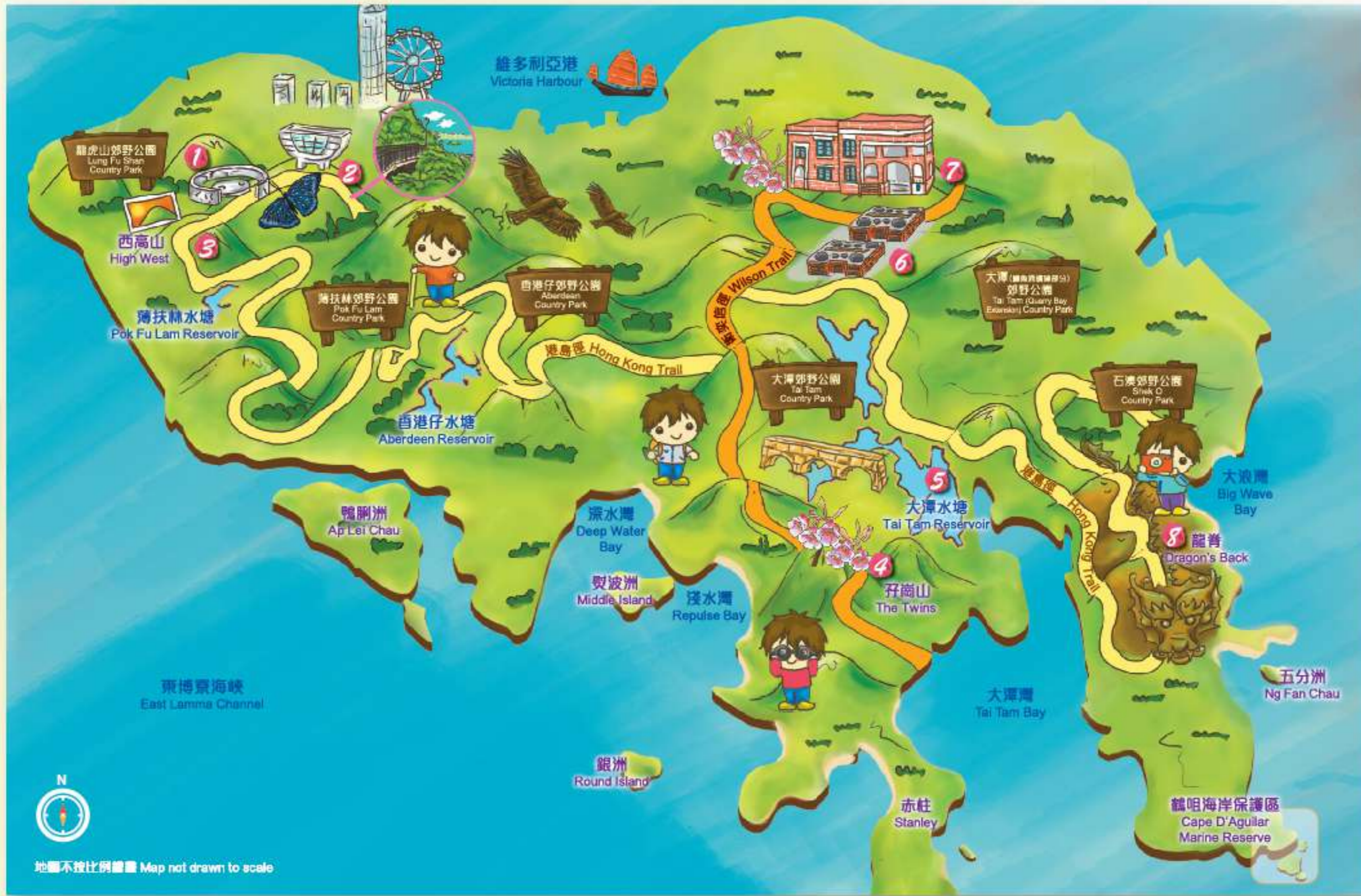
地圖不按比例繪畫 Map not drawn to scale