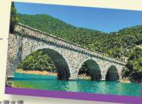
大潭水塘 Tai Tam Reservoir

大潭水塘是第二次世界大戰前興建的水務設施，水塘內有22項屬法定古蹟的水務歷史建築群，當中有梯級設計的水壩和花崗石拱橋托起的石橋，氣勢磅礴，屬拍攝熱點。大自然的鬼斧神工加上建築師的匠心獨運，締造了一湖澄碧的絕色美景。