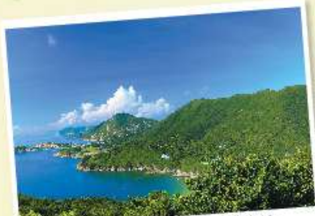
石澳郊野公園 Shek O Country Park

石澳郊野公園位於港島東南部，其中砵甸乍山、歌連臣山、雲枕山、打爛埗頂山均是著名的遠足熱點，當中最享負盛名的是雲枕山與打爛埗頂山之間的一段高低起伏的山路－「龍脊」，海外遊客也專程到訪。