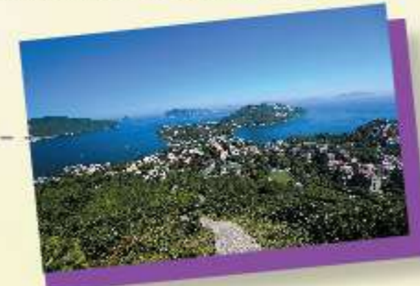
赤柱及春坎角 Stanley and Chung Hom Kok

The Twins consists of two peaks, namely, the South Twin and the North Twin. At the summit of the South Twin, we can get a 270-degree view of Stanley and Chung Hom Kok in the southern district of Hong Kong, Mount Parker in the southern district of Hong Kong, and further Tseung Kwan O. Even if there is a 1000-step "stairs" before them, hiking lovers are still full of enthusiasm.