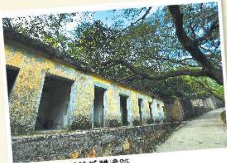
松林炮台附近掩蔽體遺跡 Battery building relics near Pinewood Battery

The Lung Fu Shan Country Park is the smallest country park in Hong Kong. Hidden in the dense forests are the Pinewood Battery, remains of old forts and other war ruins, enabling visitors to learn more about Hong Kong's history while enjoying the beauty of nature.