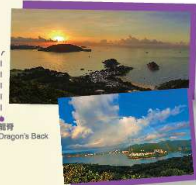
龍脊 Dragon's Back

"Dragon's Back" at Hong Kong Trail Section 8 was once selected as one of "the Best Urban Hike" in Asia. When viewed from afar, the mountain trail looks like the bone ridge of a dragon lying prostrate on the ground, hence the name "Dragon's Back". Standing high on the mountain trail, we can enjoy the breathtaking view of Shek O, Big Wave Bay and even Tung Lung Chau, Stanley and Tai Tam.