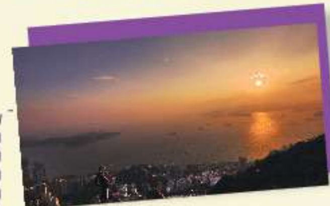
日落西高山 Sunset View at High West

高493米的西高山位於薄扶林郊野公園，從西面觀看此山外型似金字塔。山頂的觀景台可俯瞰整個香港島西面及南面海域錯落有致的島嶼，黃昏時，夕陽西下的迷人景致讓人陶醉不已。