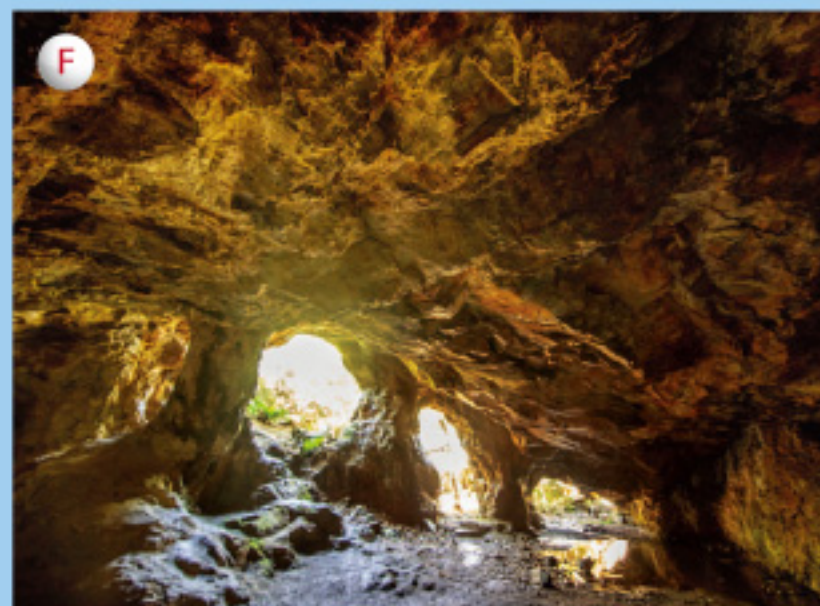
蓮麻坑鉛礦洞 Lin Ma Hang Lead Mine