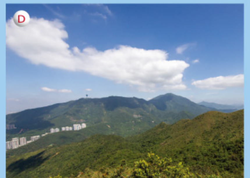
遠眺深圳市梧桐山風景區 Overlooking Shenzhen Wutong Mountain Scenic Area