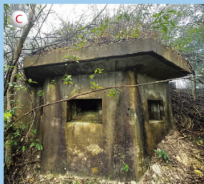
二戰時期日軍機槍堡 (亞公角) Japanese Pillbox during WWII at Ah Kung Kok