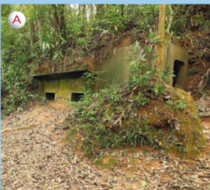
二戰時期日軍機槍堡 (山咀) Japanese Pillbox during WWII at Shan Tsui