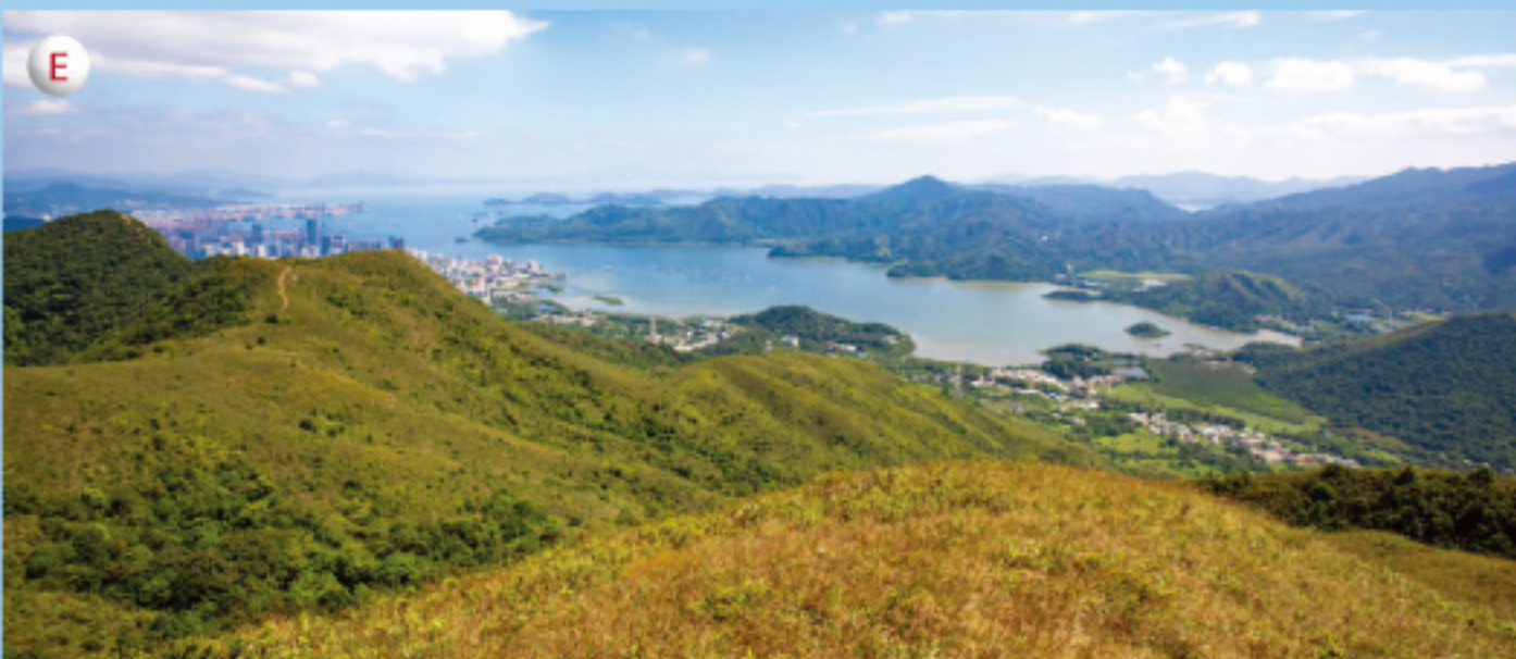
紅花寨望沙頭角海 View of Starling Inlet from Hung Fa Chai