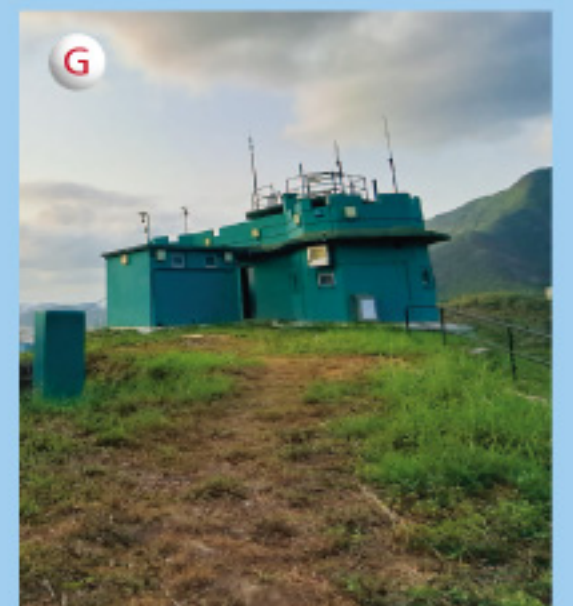
麥景陶砲堡 (礮山) MacIntosh Fort (Kong Shan)

遊覽紅花嶺郊野公園，一般需步行約4至5小時 To visit Robin's Nest Country Park, it usually takes around 4 to 5 hours of hiking